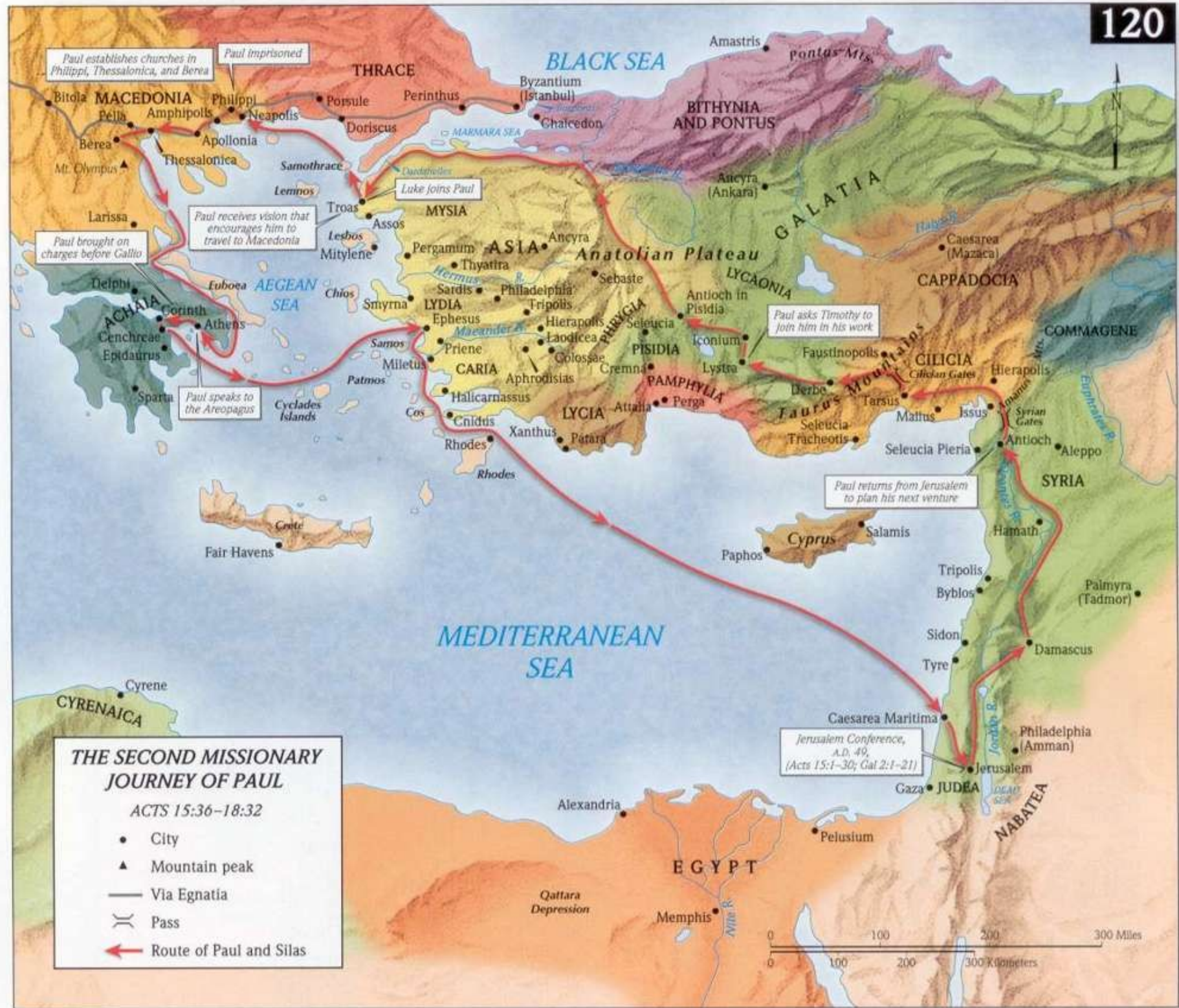
THE SECOND MISSIONARY JOURNEY OF PAUL ACTS 15:36-18:32 • City ▲ Mountain peak — Via Egnatia ) Pass ← Route of Paul and Silas

Jerusalem Conference, A.D. 49, (Acts 15:1-30; Gal 2:1-21)